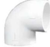
uPVC Fitting Pipe as per ASTM D-2467 SCH-80