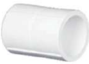
uPVC Fitting Pipe as per ASTM D-2467 SCH-80